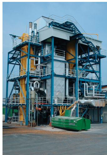
Güssing, Austria, wood gas project, 1 x JMS 620