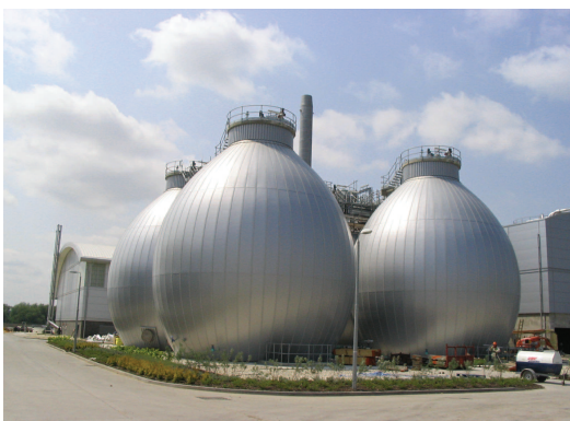
Reading, UK, sewage treatment works