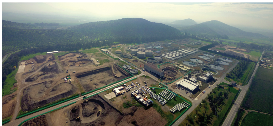
Mapocho, Chile, 3 x JMS620