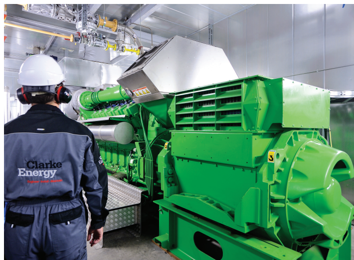
Preston Hospital, UK, 1 x JMS616