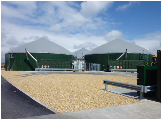
Barfoots of Botley, Bognor Regis, UK, 1 x JGMC320