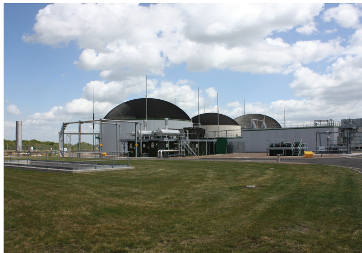
Stoke Bardolf, UK, 2 x JGMC320

The GE Jenbacher gas engine is known for having the highest levels of electrical efficiency on the market. When coupled with a contractual maintenance agreement with Clarke Energy, it will give peace of mind to the customer that they will achieve the highest levels availability and hence consistent returns from their biogas plant.