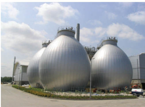
Reading, UK, sewage treatment works