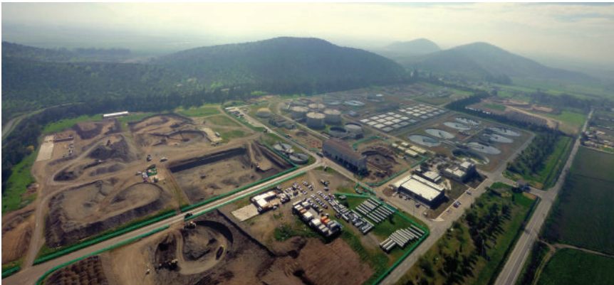
Mapocho, Chile, 3 x JMS620