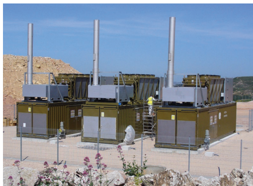
Arbois, France, 3 x JGC420